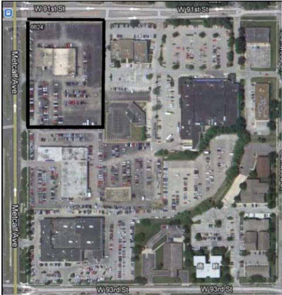
EXHIBIT B PROJECT SITE MAP