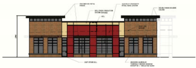
SOUTH ELEVATION BLD'G A SCALE: 1/8" = 1'-0"