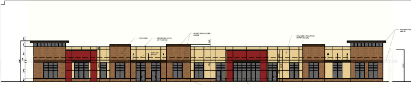
WEST ELEVATION BLD'G A SCALE: 1/8" = 1'-0"