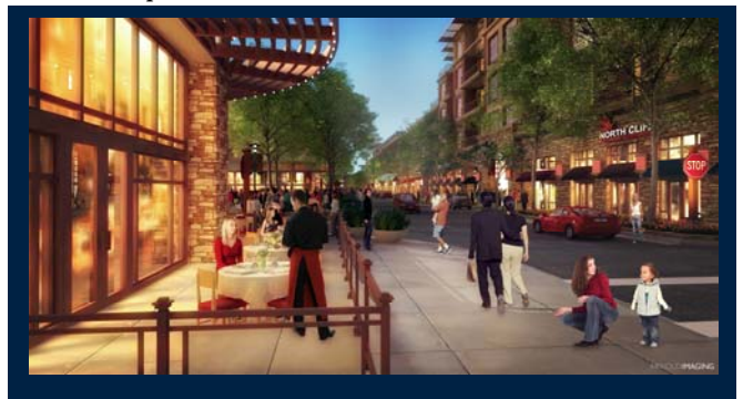
Conceptualized Prairifire Streetscape

Two such districts were created in 2011; the establishment of a 60-acre, $588 million mixed-use development named Prairiefire, and a 20-acre mixed-use development named Mission Farms West.